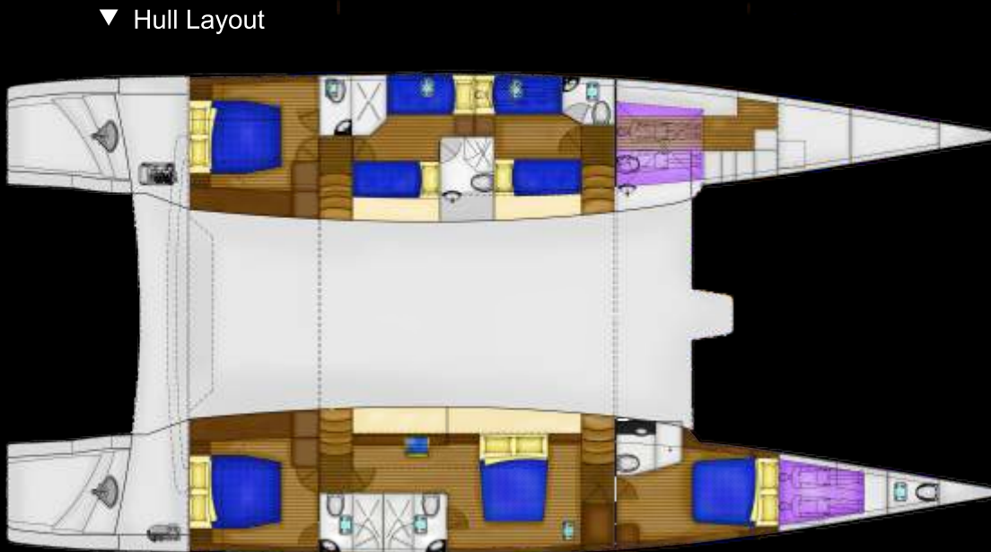
▼ Hull Layout