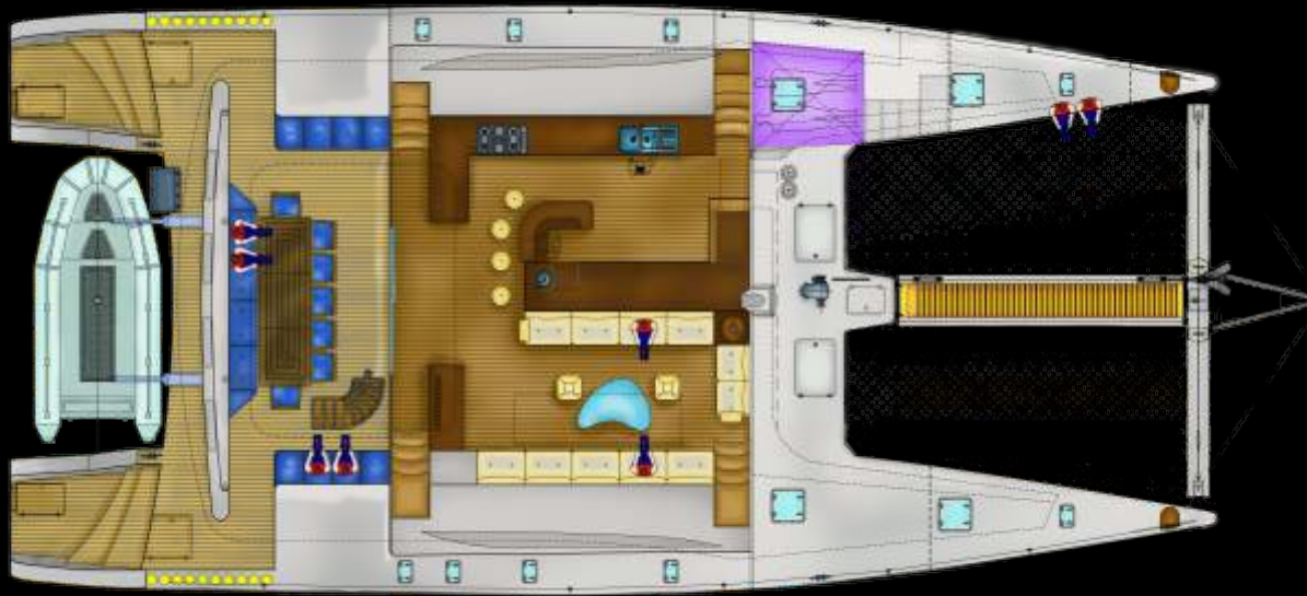
▲ Bridgedeck Layout