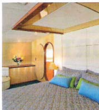
The owner's cabin is situated at the front of the cabin roof: a bedroom with an unobstructed view of the sea!