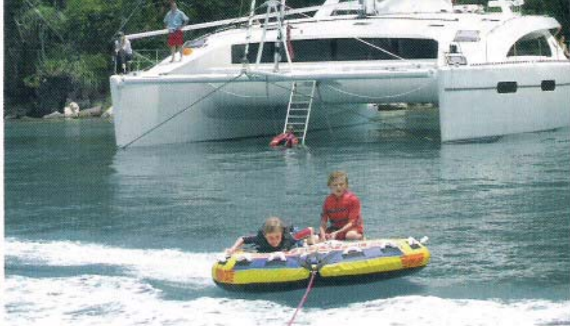
Dinghies, jet ski, towed buoys, sport catamaran, diving equipment: the Matrix can take on board enough to keep both children and adults occupied!