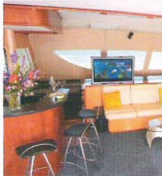
Bar, lounge, the saloon is comfortable, (very) spacious and well-designed!