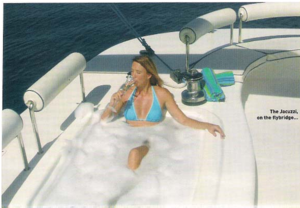
The Jacuzzi, on the flybridge...