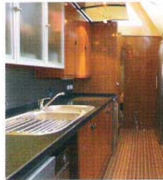
The galley, in the port hull, allows meals to be cooked just like in a restaurant...