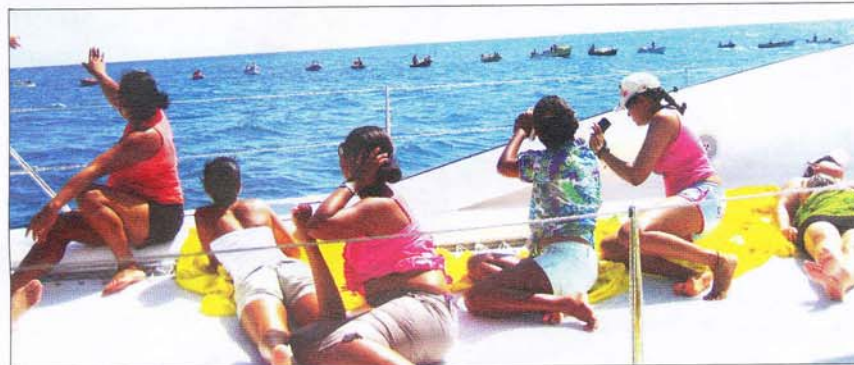
The passengers wave at and photograph the line of fishing boats

ence of CTS' latest product. So we set off with other members of CTS staff on what turned out to be a fantastic day of almost perfect Seychelles weather, although the occasional cooling drizzles of rain was a welcome break from the scorching heat. The itinerary we were