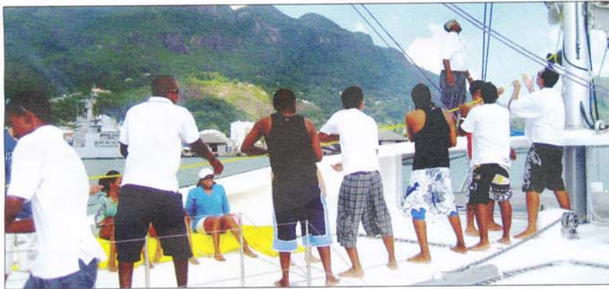
Men onboard hoisting the sail